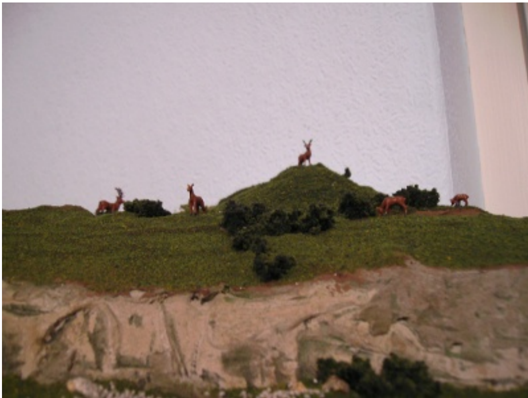
"Monarch of the Glen"