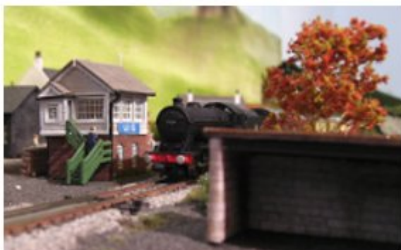
A parcel train arrives at Uig